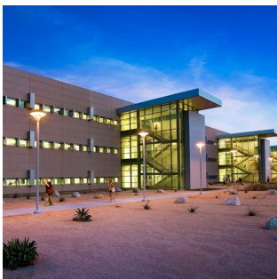
California State University San Bernardino College of Education