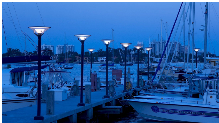
Miami Yacht Club