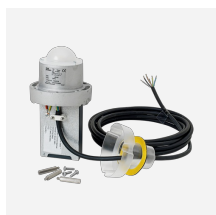
Kipp LED Upgrade Kit